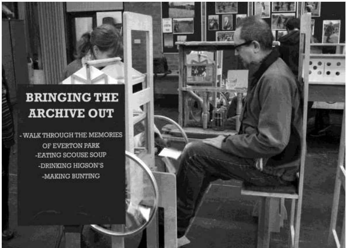
Fig. 1. Bringing the Archive out, Liverpool 2010

method establishes a non-hierarchical relationship where trust can start to form without the requirement of a direct and efficient outcome. The dialogues establish a series of relationships, which act as the future support network of the social and political architectural/urban project.